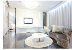
Low Voltage Products