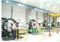
Discrete Automation and Motion