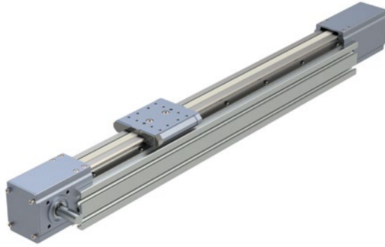
Standard LoPro® Belt Driven Actuator